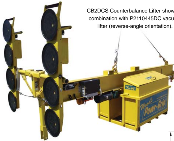
CB2DCS Counterbalance Lifter shown in combination with P2110445DC vacuum lifter (reverse-angle orientation).